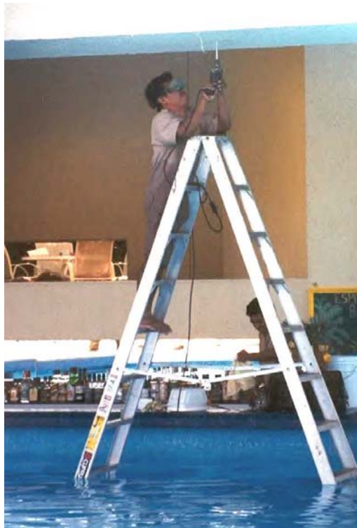
“What are the risks arising from this practise?”