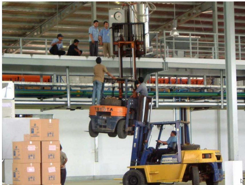
“Damage might be sudden....but unforeseen?”

The plant items can also be covered against breakdown or sudden and unforeseen damage, whereby the Insurer also pays for the repair costs should any item of plant break down whilst in use.